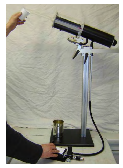
Multi axis adjustable gun support stand