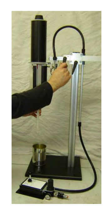
Adjustable vertical in/out and swivel