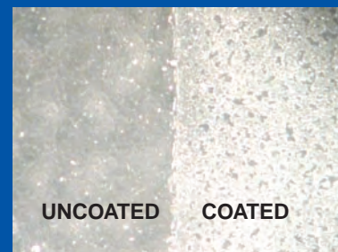
10 X Magnification