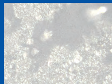
200 X Magnification